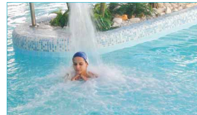
Thalsia Hotel & Spa

More information on Lo Romero can be found on their website www.loromero.com and for more information on Thalsia Hotel & Spa visit www.thalsia.com