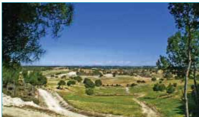
Pinar de Campoverde area

Very much a residential area rather than popular holiday location, it is ideally located to enjoy the wonderful beaches of the Mar Menor.