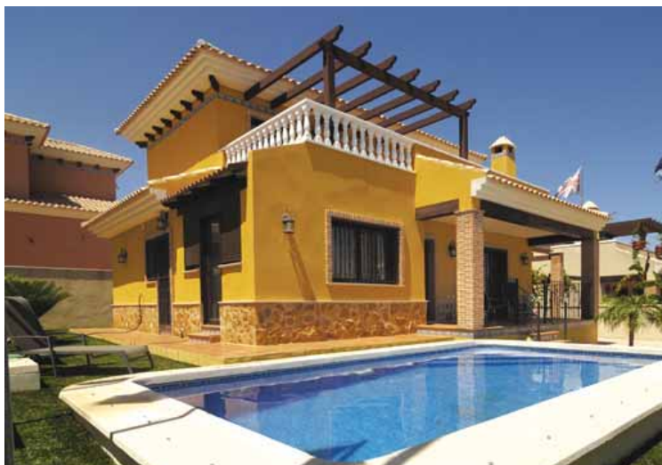
VISTAS EL CASTILLO CAMPOVERDE, SPAIN