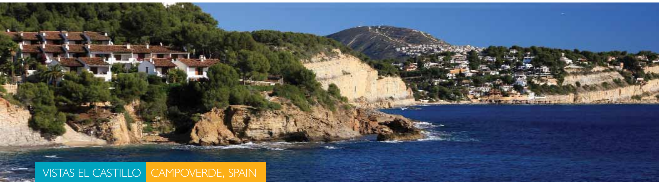
VISTAS EL CASTILLO CAMPOVERDE, SPAIN

Equally accessible are the blue flag beaches of Cabo Roig where numerous sandy coves are popular with local and tourist sun worshippers. Close to the beaches are popular bars, restaurants and cafes that offer the widest variety of entertainment and fine dining imaginable.